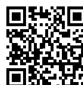
AMTOI Knowledge Sessions