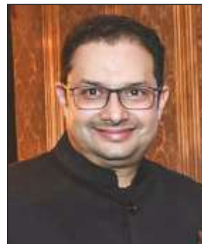
Xerrxes Master Tenure - 2021-